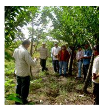
Wildlife Forestry Restoration, ForestSense, Nicaragua

Analyze and design carbon forestry and related land use project documents