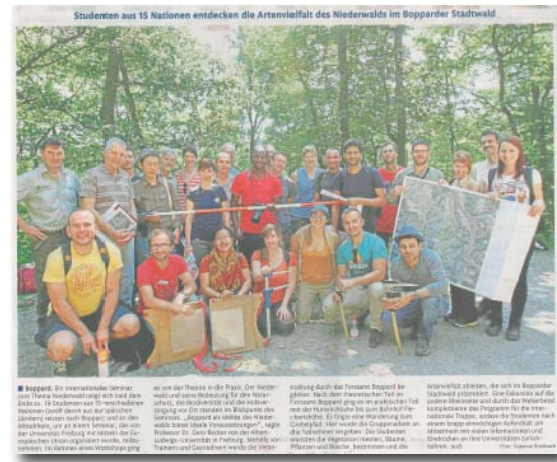
Article on the Training School, published in the Boppard local newspaper

The 19 Trainees who participated in the Training School are affiliated to institutions in 12 different COST countries and formed a mix of 15 nationalities. There was variation in the backgrounds of Trainers as well, with international (England, Czech Republic and Slovakia), as well as local (German) representatives, who offered much support and expertise throughout the week (the distribution of Trainers between modules and presentations can be seen in the program in the Annex of this document).