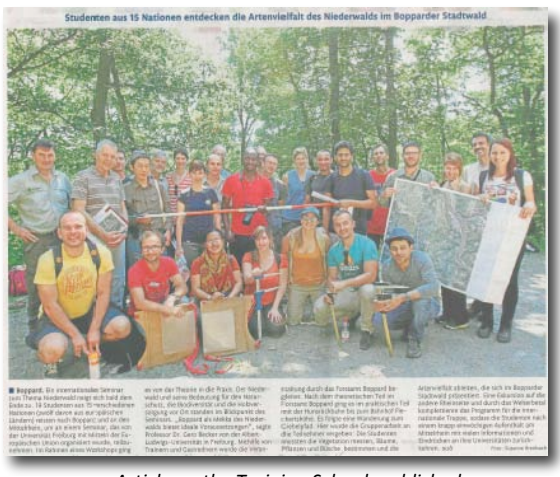
Article on the Training School, published in the Boppard local newspaper

The 19 Trainees who participated in the Training School are affiliated to institutions in 12 different COST countries and formed a mix of 15 nationalities. There was variation in the backgrounds of Trainers as well, with international (England, Czech Republic and Slovakia), as well as local (German) representatives, who offered much support and expertise throughout the week (the distribution of Trainers between modules and presentations can be seen in the program in the Annex of this document).